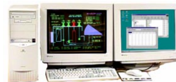
Desk Top Version - Dual Monitor Option

Tetragenics' new MC3000-NT Master Alarm Control System offers advanced performance features like Ethernet networking, Internet/Intranet connections, Windows-based database editors, and automatic screen generation all on a Windows NT platform (or Windows 98 or 95). But you're not just getting high tech equipment in a box. When you buy an MC3000-NT System, you get the company behind the system — a company with over 25 years of control and automation experience. There's more to the MC3000-NT box than hardware and software. There's the company that stands behind it.