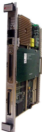
VME CPU G-Series

PPC 7410/450MHz: 4.09 amp/20.45 W (power req. differs with configuration)